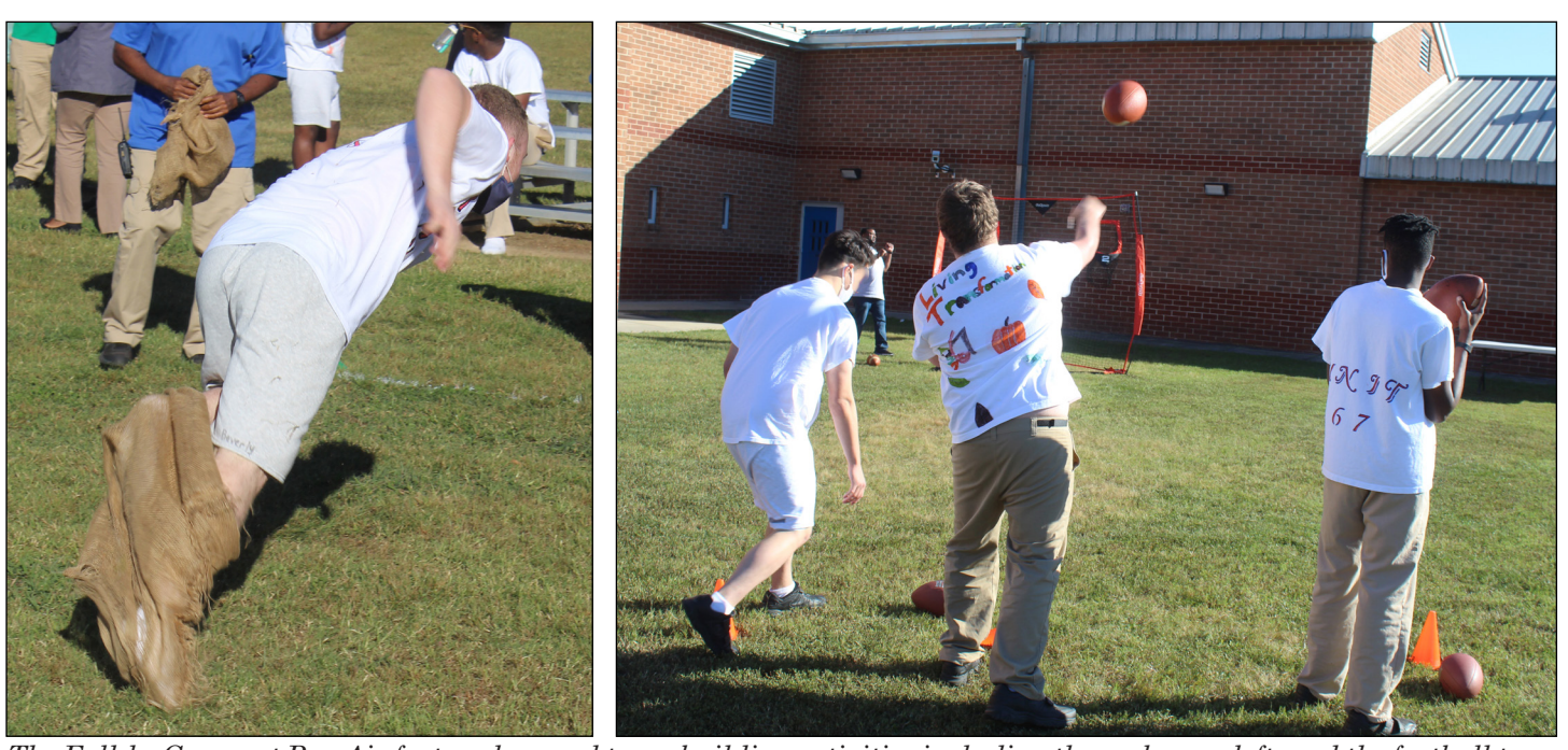
The Fall-la-Ganza at Bon Air featured several team-building activities including the sack race, left, and the football toss.